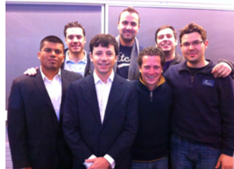
THE LATINO LEADERSHIP ASSOCIATION (LLA)

LLSA seeks to represent the interests of Latino students at the law school while also raising awareness of Latino social and cultural issues through academic and social programming. We do this by meeting as a community on a regular basis, inviting guests to engage with current students, and honoring distinguished alumni with the LLSA Public Service Award Dinner.