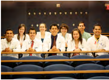
THE LATINO MEDICAL STUDENT ASSOCIATION (LMSA)

Latino Graduate and Professional student groups help graduate students network, find solace in the familiarity of a Latino community, and provide the chance to unwind with social events. The student groups also reach out to Yale Latino undergraduates and regularly participate in conferences, panels, and talks. La Casa provides these groups with resources and a home base from which to work.