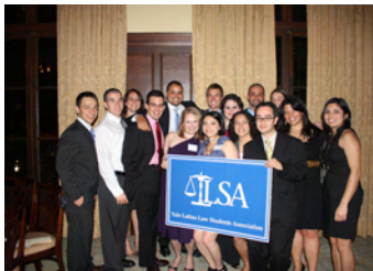
THE LATINO LAW STUDENTS ASSOCIATION (LLSA)

The LMSA is committed to developing a network for Latino medical students. We strive to promote awareness about issues affecting Latino health while highlighting the contribution of Latinos in the medical field and encouraging other minority students to enter the health profession by serving as mentors.