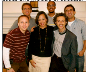
THE YALE DIVINITY LATINO/A ASSOCIATION (YDLA)

The goal of the LLA at the Yale School of Management is to promote Latino leadership in business and society. We collaborate with the National Society of Hispanic MBAs, build relationships with Hispanic SOM Alumni, network with corporate recruiters who are interested in Latino MBAs, and communicate with other Hispanic organizations both on and off campus to discuss common issues and models of success.