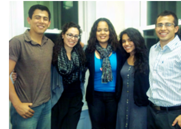
THE LATINO GRADUATE NETWORK (LGN)

YDLA seeks to create a space that fosters fellowship and partnership within the Latin@ community at YDS. YDLA is composed of anyone who self identifies as Latin@ or who has close ties and connections with the Latin@ community. YDLA offers the Latin@ community a space to raise concerns, interests, and to begin conversations that pertain to a wide variety of Latin@ issues. YDLA also provides its members an opportunity to share and represent their community, culture, and interests with the rest of the YDS community.